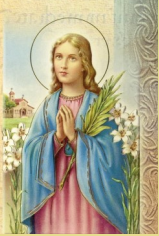
St. Maria Goretti

Maria was born in Italy in 1890. She had 5 siblings. Her father was a farmer but he died soon after she was born. Her mother continued to work the farm and Maria helped with the children. Her mother described her as being very encouraging and cheerful. When Maria was six, her family had become so poor that they were forced to move, and work for other farmers.